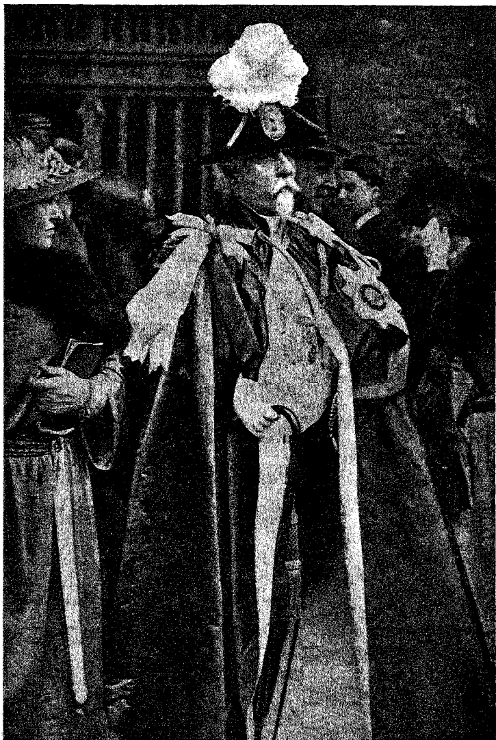
SIR BASIL ZAHAROFF

Installation, New Knights of the Bath, Westminster Abbey, May 21, 1924