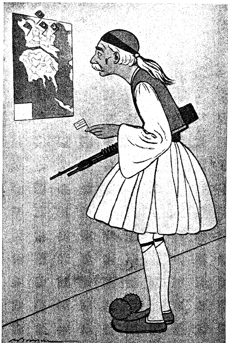
Cartoon from "Fantasio", November 1, 1922.